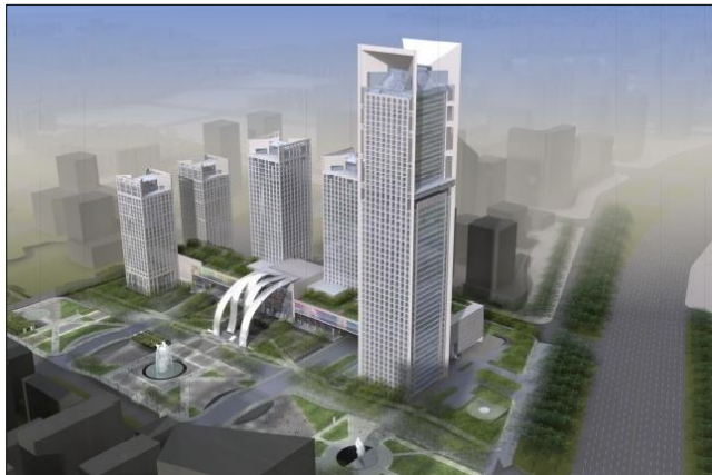
Jinan Financial Center Jinan, China