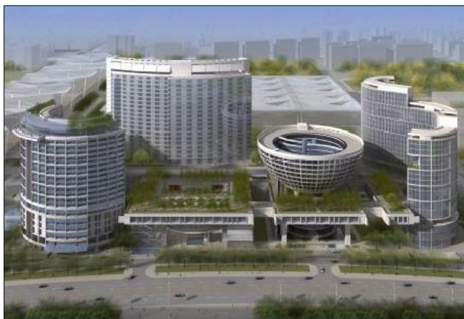
Shanghai Expo Shanghai, China