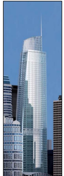
Wilshire Grand Los Angeles, California

all to ensure our clients' projects function over the long term.